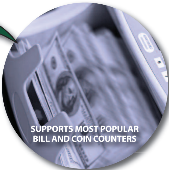
SUPPORTS MOST POPULAR BILL AND COIN COUNTERS