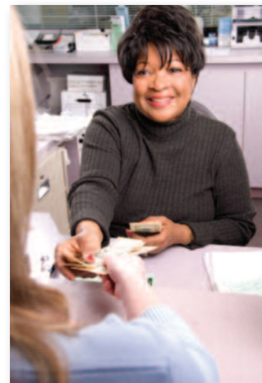
TellerCounts Frees Up Your Staff To Spend More Time With Customers.

In Overlay Mode, when the PRINT button on the currency counter is pressed, a secondary window pops up on the PC. Instead of the totals immediately entering into the teller app, the Overlay Window allows multiple passes from the currency counter to add together into a single set of denomination totals. Mutilated pieces that the counter won't accept can also be entered easily. When the operator has counted everything, the TellerCounts Accept button enters the entire set of counts into the teller app.